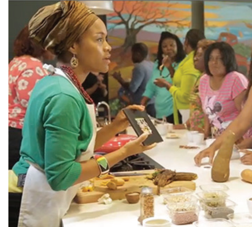
Teaching urban gardening and exploring healthy food options from preparation to presentation