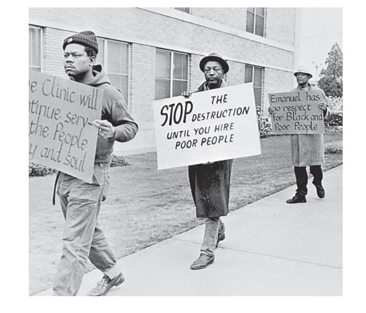
To provide historical education

Providing resources that make accessible holistic health and wellbeing for everyone. To include spaces for counseling and emotional healing. The center will offer psychiatric care for those experiencing mental and emotional complications.